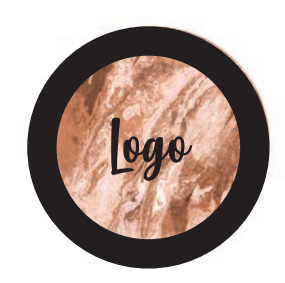
Matte View Compact Ideal for logo printing

PRESSED POWDER BRONZER Pressed powder bronzer that of be used on the face and body. Pressed powder bronzer that can