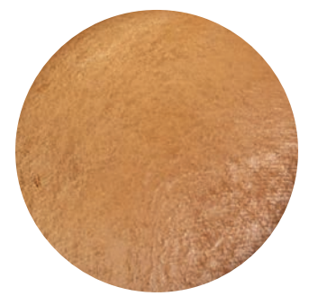
LIVE IN THE