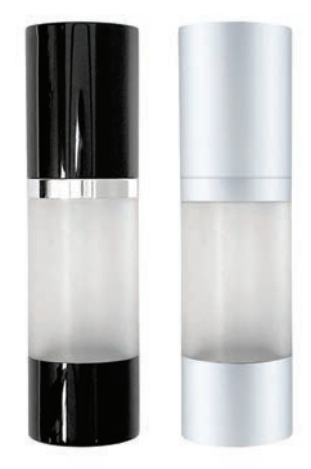
Custom 30mL packaging also available