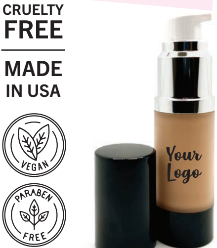
Ask your Brand Consultant about our NEW black packaging

Black Toggle bottle - Ideal for adding a label Comes boxed, includes shade label with room to add your label