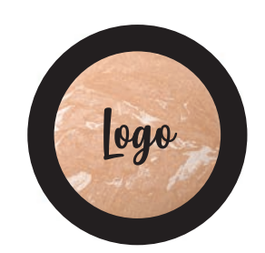
Matte View Compact Ideal for logo printing