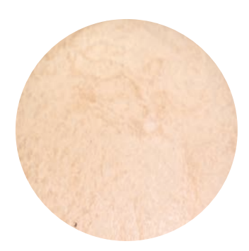
DIAMONDS & ROSES