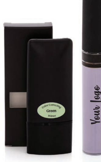
custom packaging options available