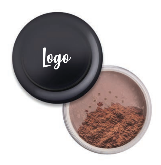
REGULAR SIZE Matte black cap sifter jar Ideal for logo printing