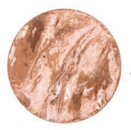
Pan only in clam shell