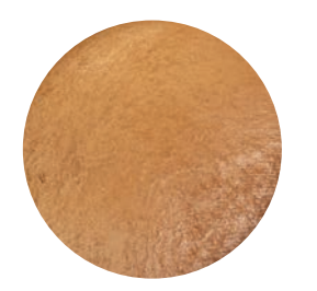
Pan only in clam shell