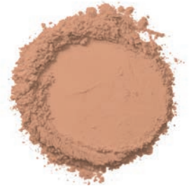
CAFE AU LAIT