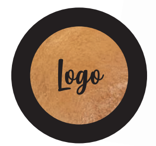
Matte View Compact Ideal for logo printing