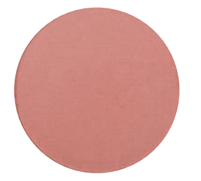
Pan only in clam shell