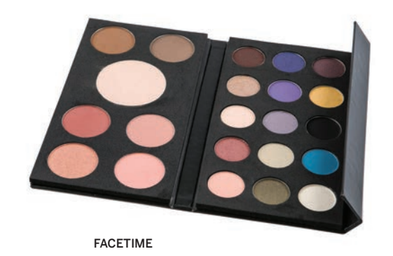
Your Logo or Design